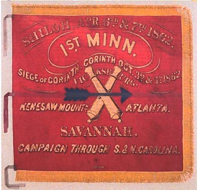
They are from, top to bottom and left to right, 1st Texas Infantry, 1st Arkansas Volunteers, 36th Pennsylvania Volunteers, 2nd Wisconsin Co. F, The Prattville Dragoons of Alabama, 26th Ohio Volunteer Infantry, and the 1st Minnesota Light Artillery.